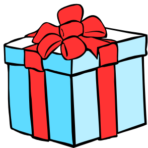
Birthdays/Anniversary Gift Raffle. We had 4 gifts (2

Randi talked about places we are receiving