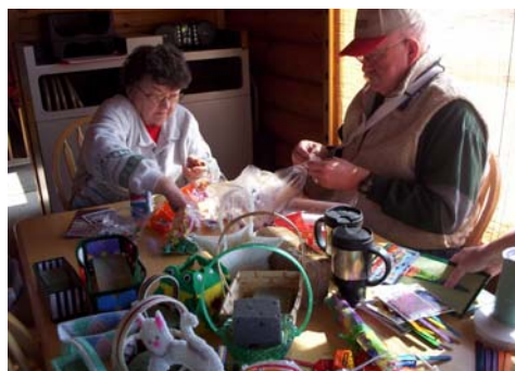
Making Easter baskets to sell at Brat Sale April 8th.